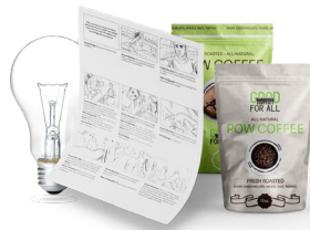
Many Concepts or Ideas