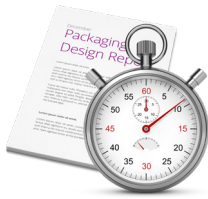
A Fast-Approaching Deadline