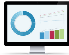
To Have Reliable, Real-Time Data